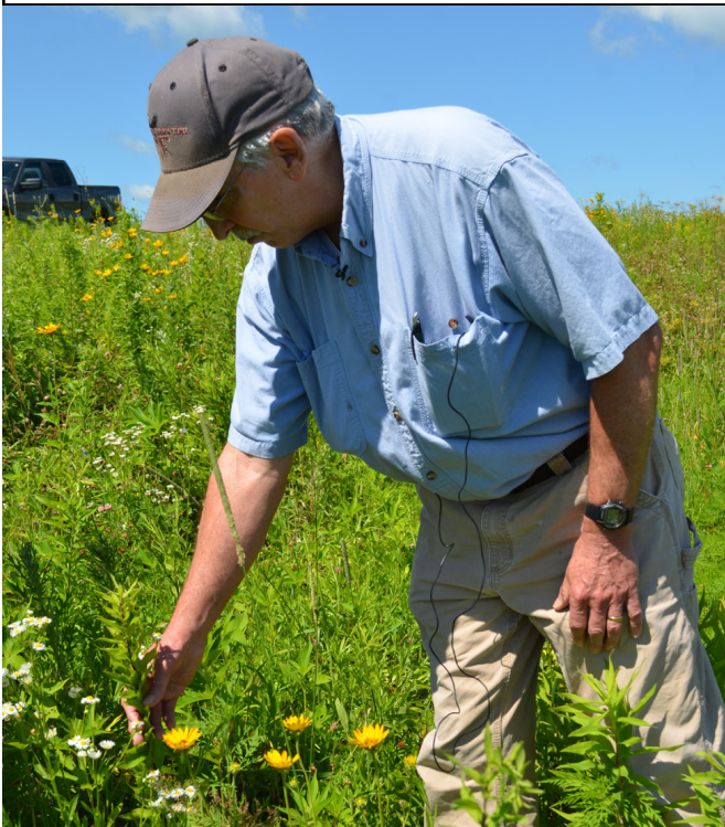
Landowner observing progress of habitat improvement