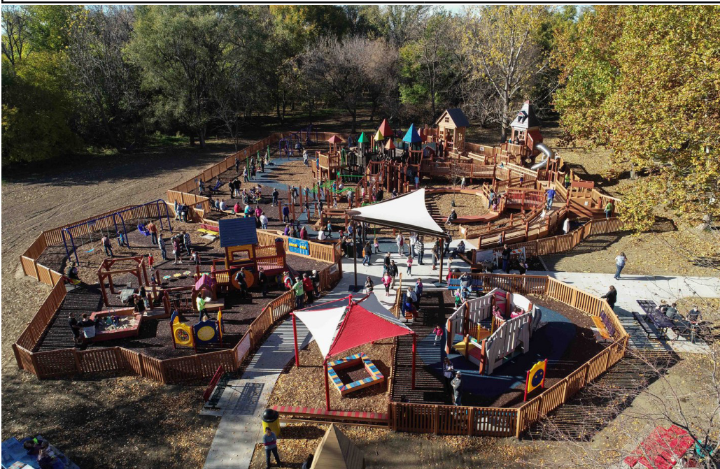
Lake Manawa State Park’s Dream Playground is the largest accessible playground in Iowa. Designed in the 90’s it was re-designed with many new accessible features updated or added.