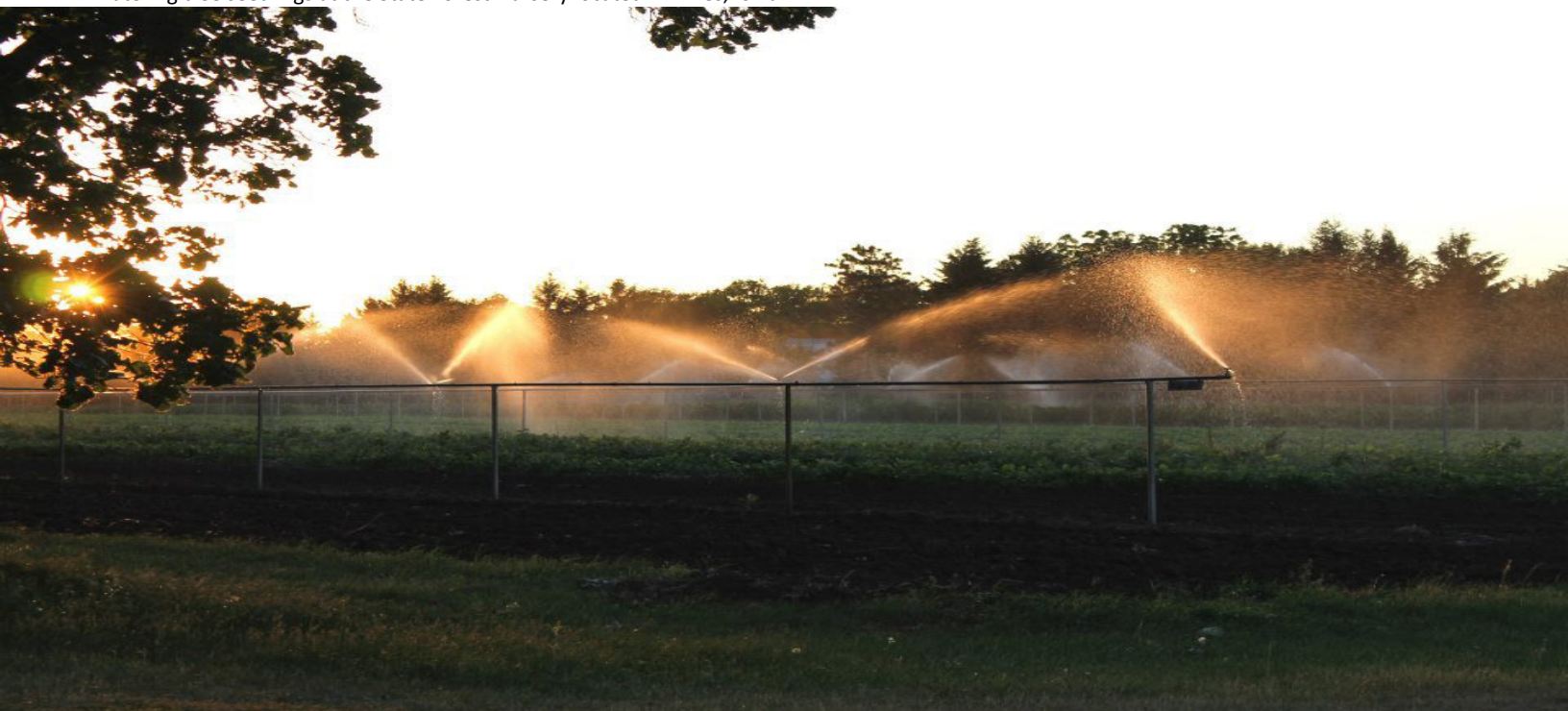
Watering tree seedlings at the State Forest Nursery located in Ames, Iowa