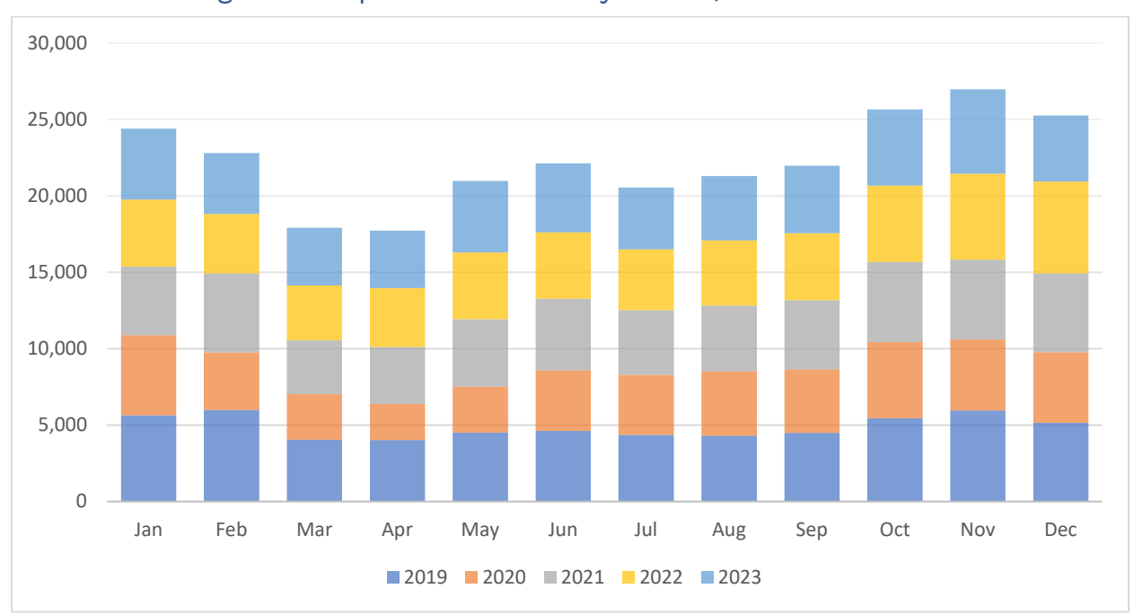
Figure 2: Reported Crashes by Month, CY2019-CY2023