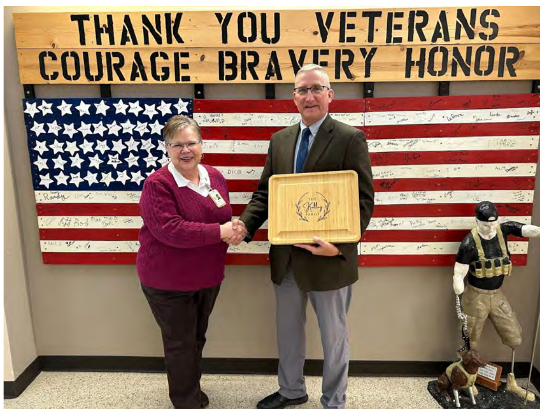
Nursing Services Director receiving her service award for 35 years.

The Employee Service Awards were presented in March to over 60 staff members with 10 or more years of service. We truly appreciate their loyalty to the State of Iowa. We recognized 2 staff members with 35 years of service!